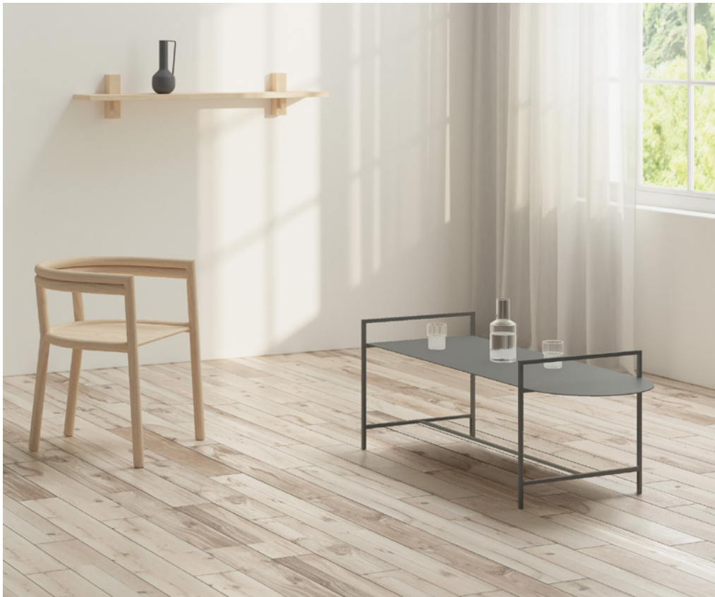
HETA | long table by Appareil Atelier